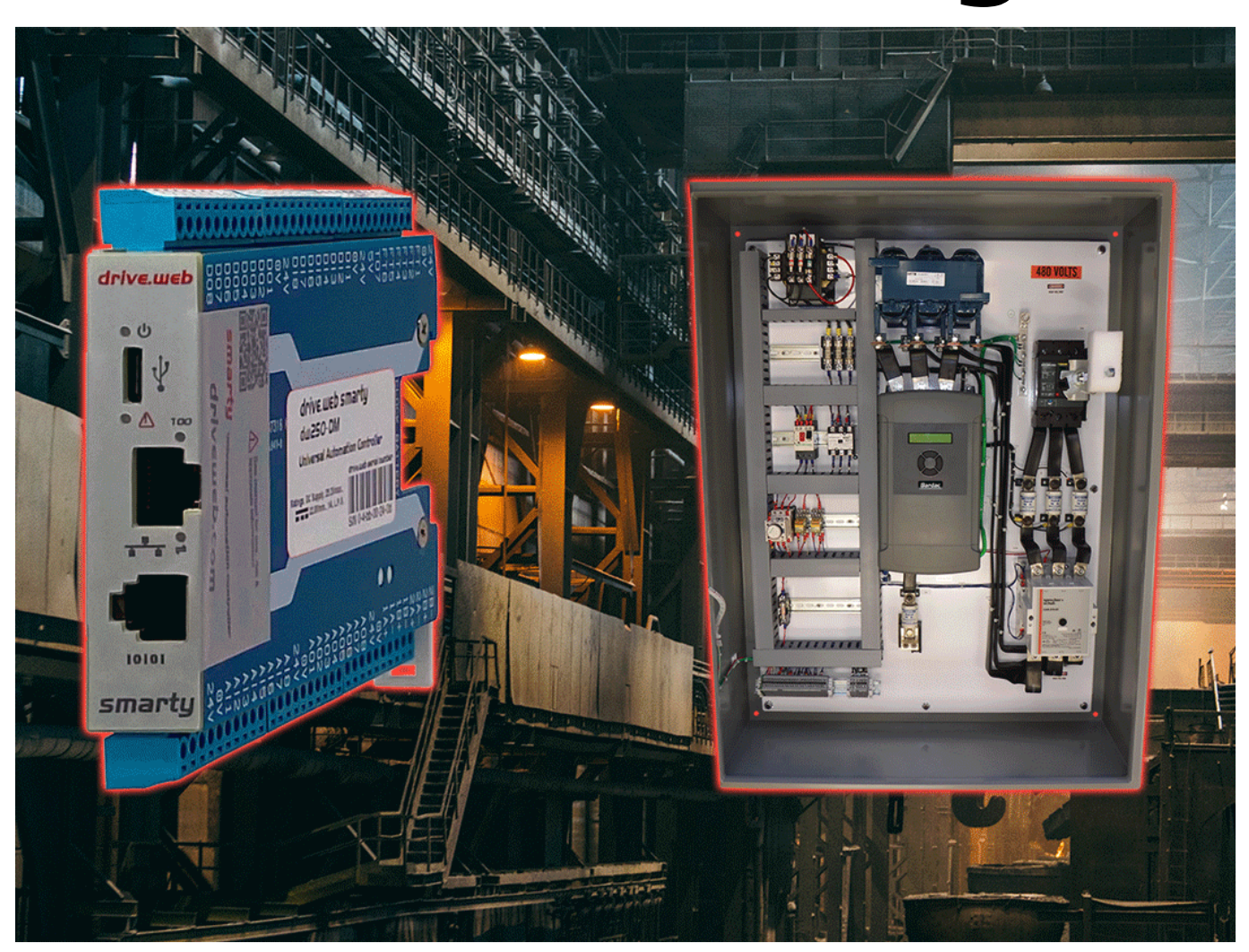
plug-in a smarty brain